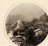
Start point of Forest Railroad