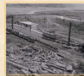
Old Tuchang Station